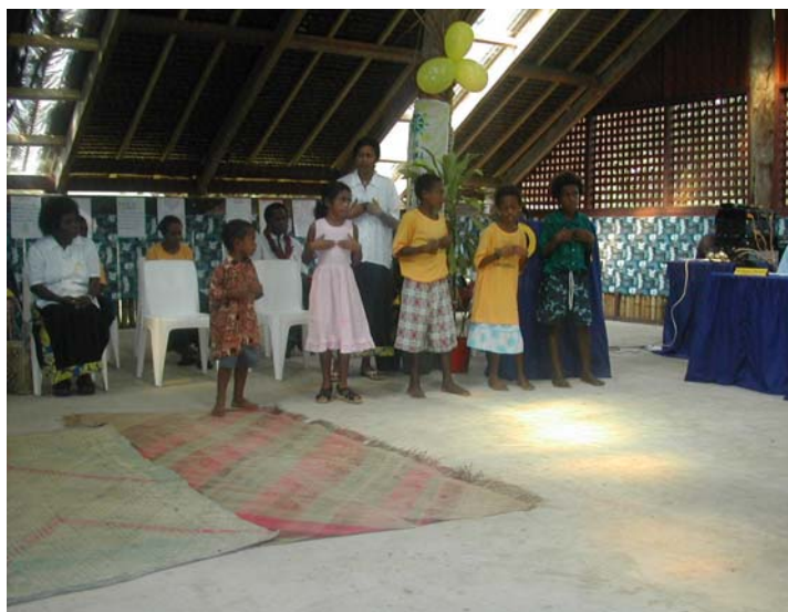
Frangipani Kids in 2005

Frangipani continues to play a pivotal role in promoting rights of children, provision of support to parents and caregivers, advocating for universal access to public transport in the SANMA Province. Seizing opportunities such as 3 December and days when the tourist boat come into town, they have had much success in raising the awareness of people in both the urban centre of Luganville as well as in the remote villages on the island of Santo. 2006 saw the 'Frangipani Kids', a popular theatre, perform throughout the province.