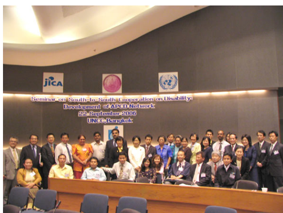
DELEGATES AT THE UN ESCAP / APCD SOUTH TO SOUTH MEETING, BANGKOK

Statement for thought from 1 st Pacific Consultation on Disability and the Church: