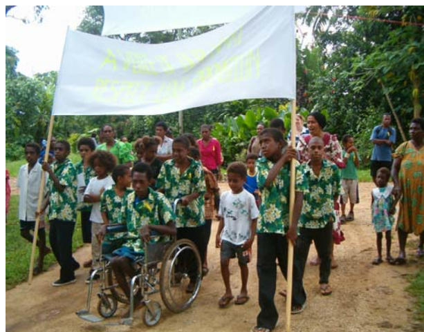
Frangipani Kids on their way to celebrate 3 December 2006 at Rowhani School